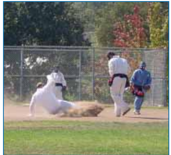
Figure 1: Contractor in protective gear simulates baseball activity

U.S. EPA's concern is further heightened because this preliminary conclusion may not fully account for the higher toxicity of amphibole asbestos, as well as other uncertainties related to short-term, intermittent exposures early in life. Therefore, the actual risk potential may be higher - although current Agency risk assessments cannot specify exactly how much higher.